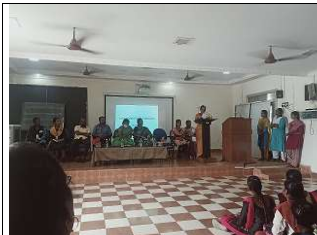
PHOTO 1 WELCOME ADDRESS