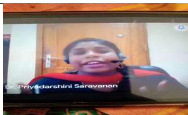
PHOTO 2 CHIEF GUEST SPEECH