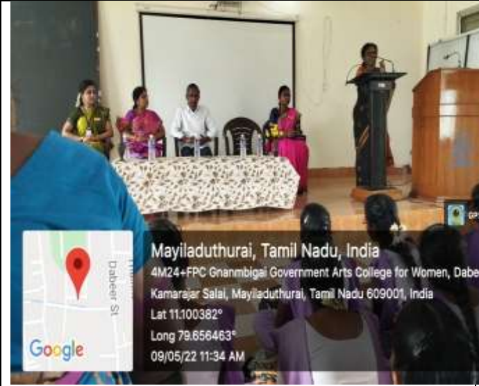
PHOTO 1 WELCOME ADDRESS