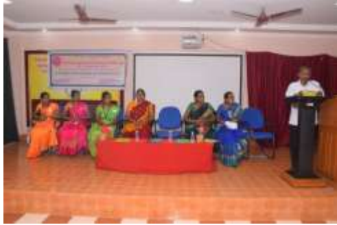
PHOTO 1 PRESIDENTIAL ADDRESS BY THE PRINCIPAL