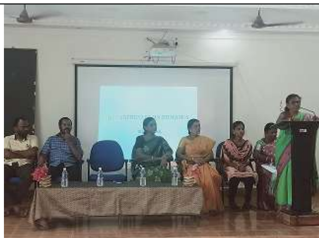
PHOTO 2 PRINCIPAL IN-CHARGE