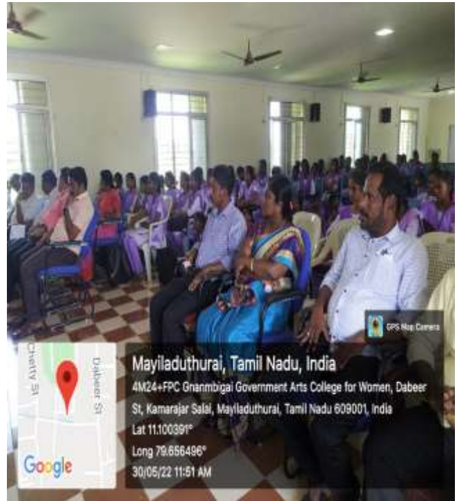
PHOTO:2 Staff and Students