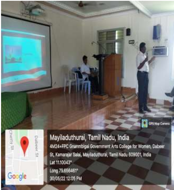
PHOTO: 1 Chief Guest Lecture