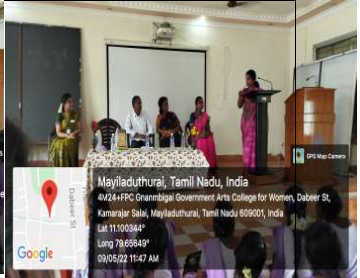
PHOTO 2 CHIEF GUEST SPEECH