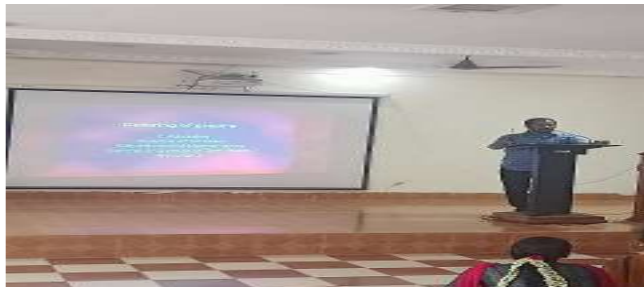
PHOTO 3 CHIEF GUEST