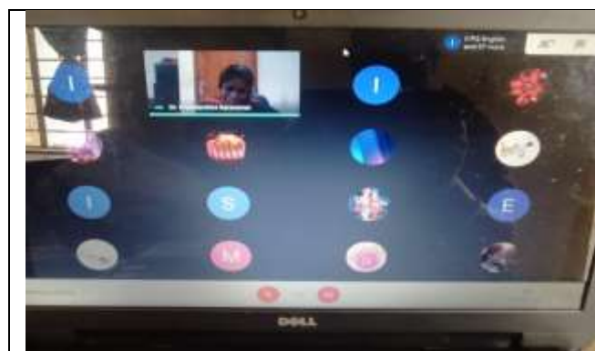
PHOTO 1 ACTIVE PARTICIPATION OF ONLINE SEMINAR