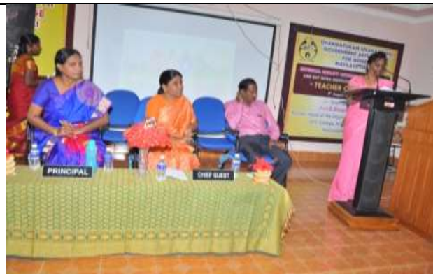
PHOTO 1 INTRODUCTION OF CHIEF GUEST